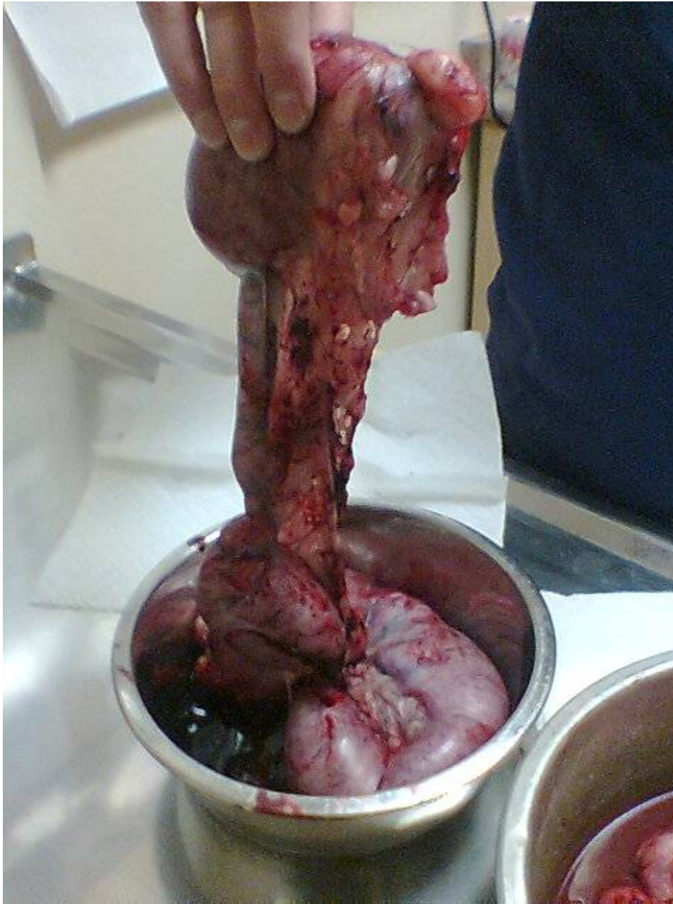
Uterus from 12 year old American Eskimo with pyometra, not deflated. (Above and below)